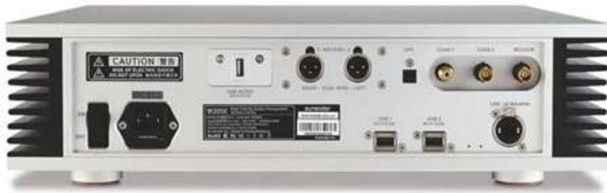
ABOVE: An isolated Gigabit Ethernet port [lower right] is joined by two USB-A 3.0 hubs for outboard drives and an external word clock input. Outputs are on USB-A 2.0 (384kHz/32-bit; DSD512), Dual-AES (DSD128 over DoP) and coax/opt (192kHz/24-bit)

is the only determinant of sound quality in such a set-up. Indeed, as PM's Lab Report [opposite] shows, the W20SE potentially brings more to the party with lesser DACs, while also proving an excellent source with high-end converters.