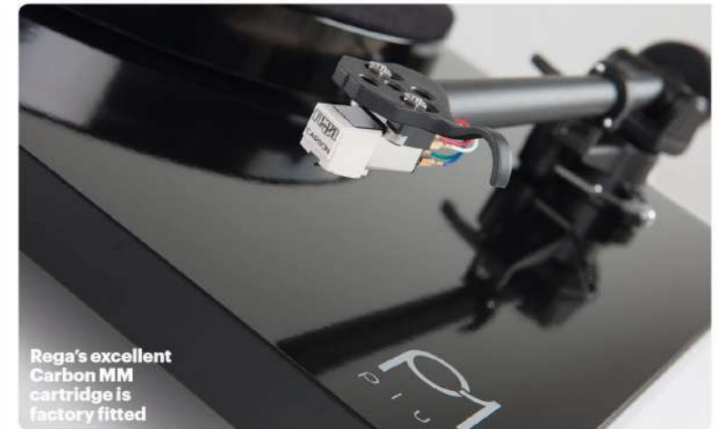
Rega's excellent Carbon MM cartridge is factory fitted

The Planar 1 Plus is similarly priced to the Audio-Technica AT-LP5 (HFC 415), which is also designed with a view to use in a fit-and-forget context. Out of the box in their shipped condition, the better phono stage and arm of the Rega are capable of a superior sonic performance. Where the LP5 hits back is that it is far easier to push the spec beyond what comes supplied. It is easy to change and accommodate a variety of cartridges, the phono stage can be switched out and it is unusually receptive to other tweaks and upgrades. If, however, you simply want to buy a turntable with great performance from the off, the Planar 1 Plus is the superior solution.